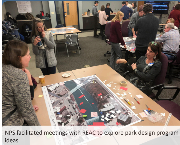
NPS facilitated meetings with REAC to explore park design program ideas.

The NPS team led an extensive process that began with a comprehensive review of previous proposals, documents and plans dating back 30 years. Improvement ideas were listed and mapped. The Committee then brainstormed additional specific ideas to augment those listed from earlier studies. This process was closely tied to the goals of the City's 2008 Comprehensive Plan.