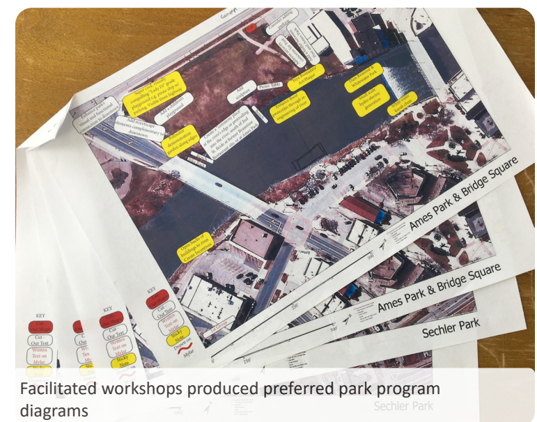
Facilitated workshops produced preferred park program diagrams

In December, 2019, a park planning workshop involving REAC members and Northfield Park Board members was facilitated by NPS staff. The outcome was a series of 4 programmatic concept diagrams for each of the four parks, which were presented back to the REAC Committee; an NPS facilitated discussion led to preferred programs for each park. These were developed into more refined concepts by the consultant team retained by the City. More detail about each of the park concepts is addressed in the individual project pamphlets.