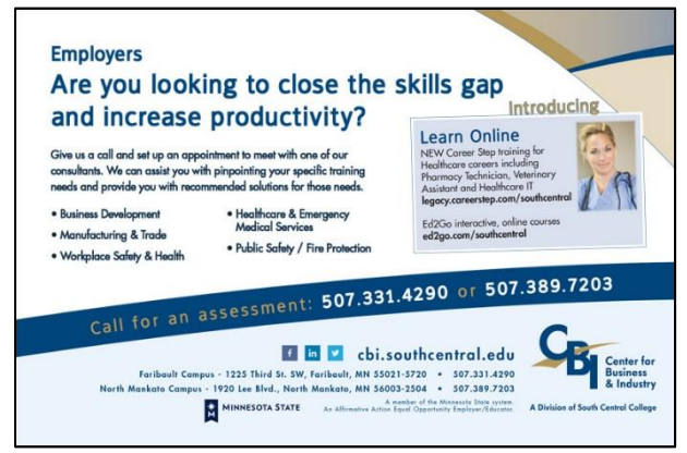
Photo: ad for South Central College, Center for Business & Industry.

Strategy 2. Collaborate with business, educational institutions, community organizations, and government to provide information to local businesses.