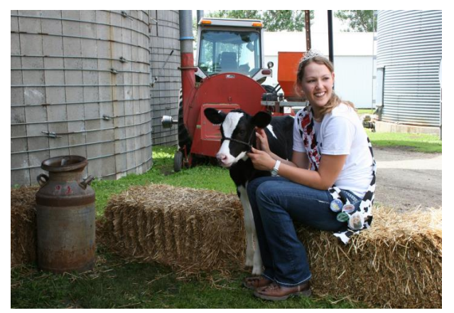
Photo: "A Day on the Farm" at the Wegner Dairy Farm.