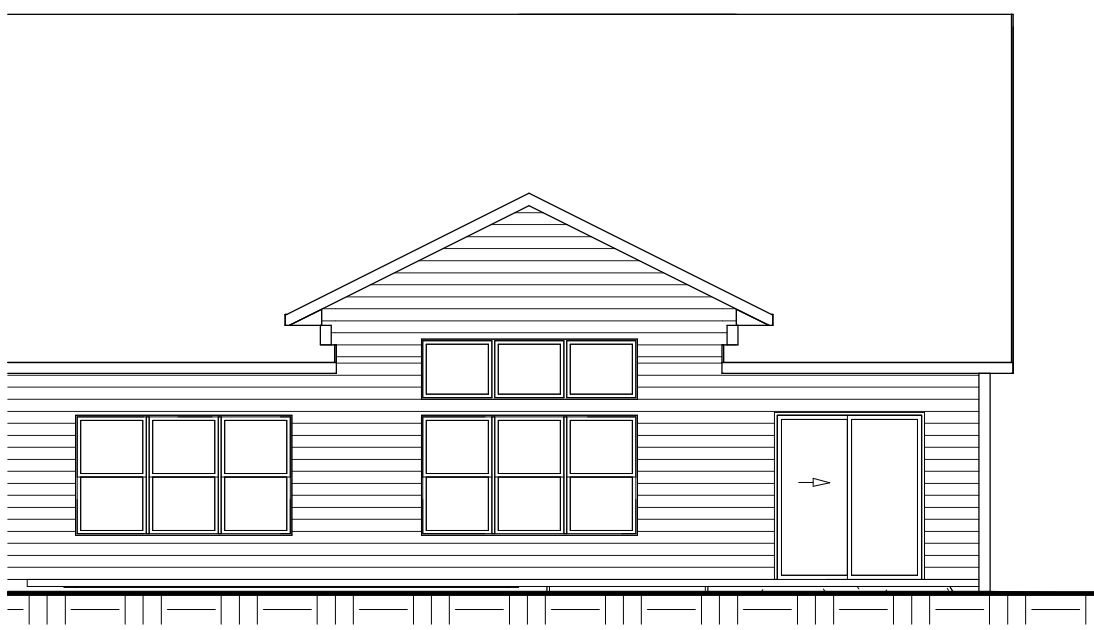
3 REAR ELEVATION A-201 1/8" = 1'-0"