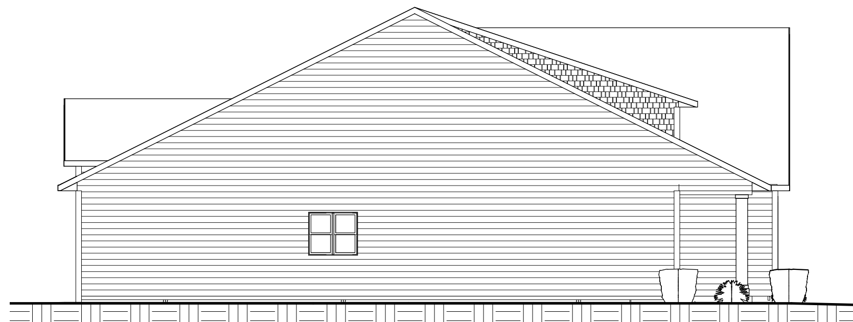
4 LEFT ELEVATION A-201 1/8" = 1'-0"