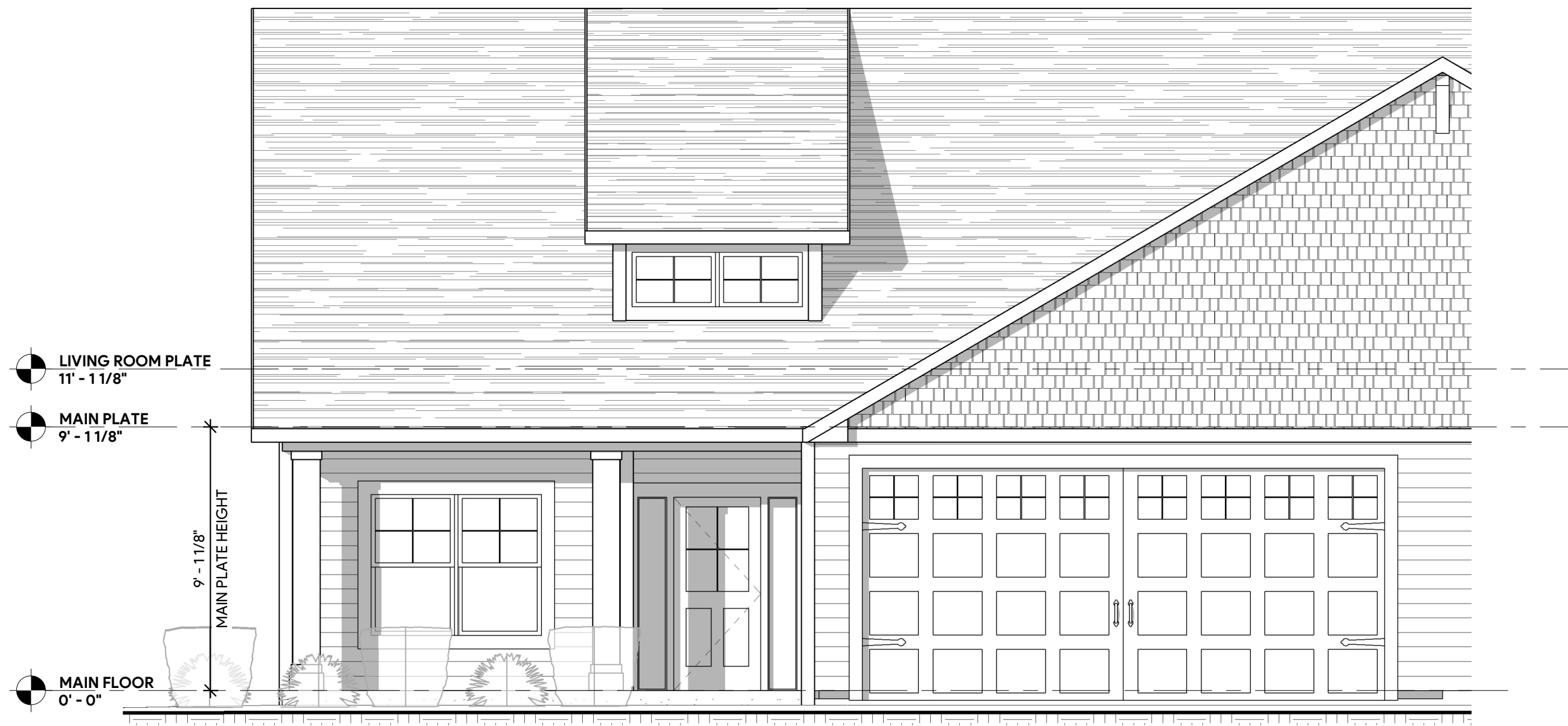
1 FRONT ELEVATION A-201 1/4" = 1'-0"