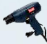
CORDED DRILL (10)