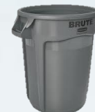
GARBAGE CAN (5)