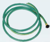
GARDEN HOSE (3)