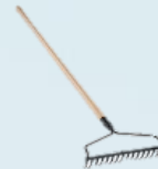
METAL RAKE (25)