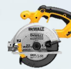
CIRCULAR SAW (2)