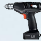
CORDLESS DRILL (5)