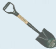
SPADE SHOVEL (25)