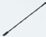
DIGGING BAR (3)