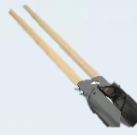
POST HOLE DIGGER (3)