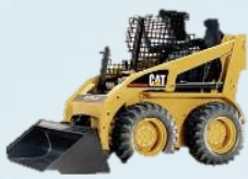
SKID STEER (1)

The Community Partner will be responsible for providing tools during Build Week. Sample tool list below: