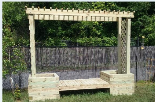
SEATING & TABLES