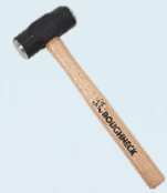
SLEDGE HAMMER (2)