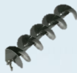
14" AUGUR BIT