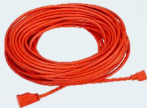
EXTENSION CORD (4)