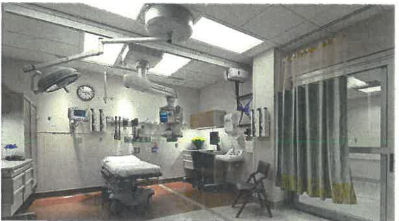
6.H. Relevant Project Experience