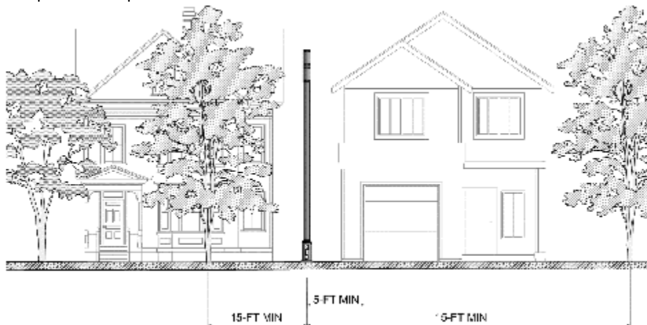
Example of Acceptable Location Between Residential Homes