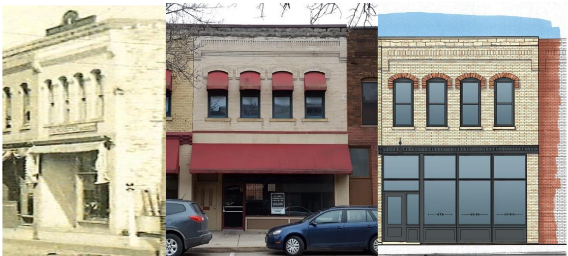
505 Division storefront photo from 1900's; winter 2017/2018; Color Illustration presented to Northfield HPC in May 2018