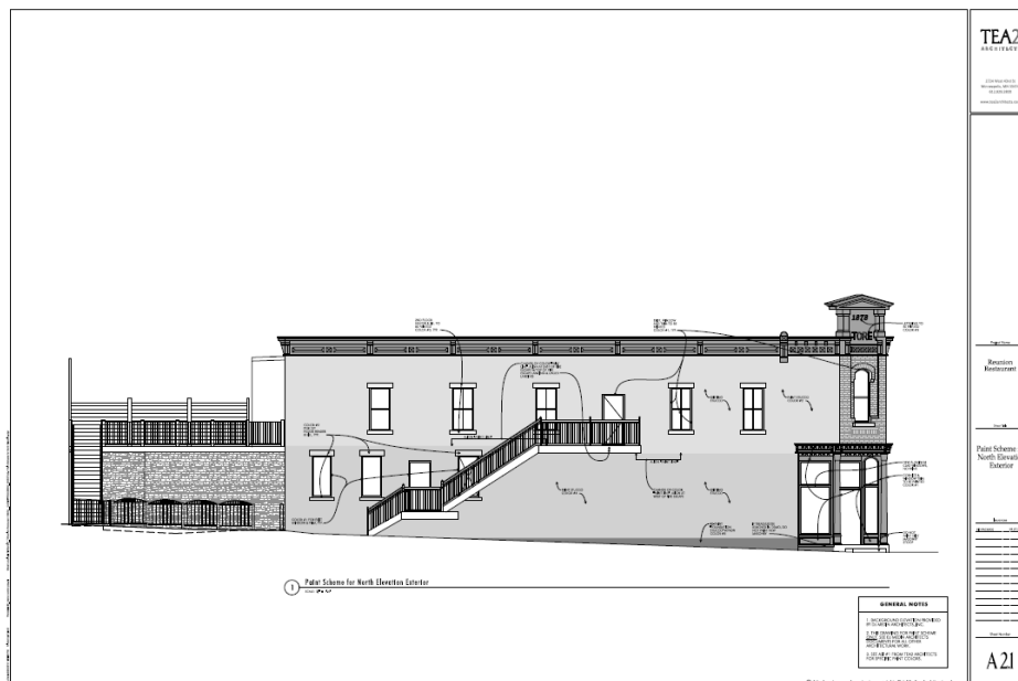
Proposed North Wall Paint Scheme