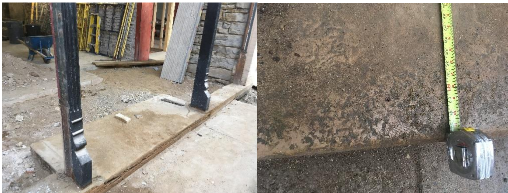
503 Division limestone threshold to be retained, will house two recessed doors and two alcove windows