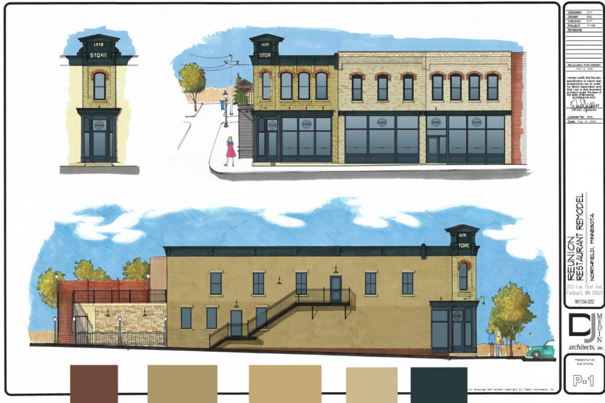
Proposed Color Exterior Drawing