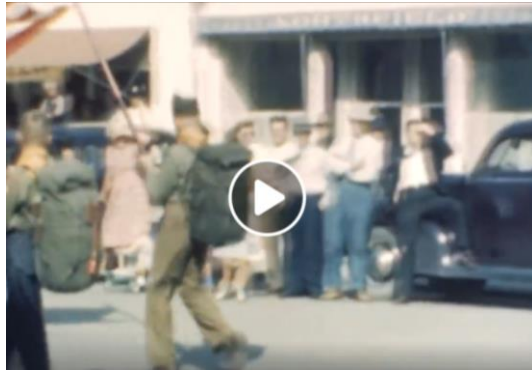
503 Division storefront image from 1946 home video, showing two recessed doors and likely two alcove windows