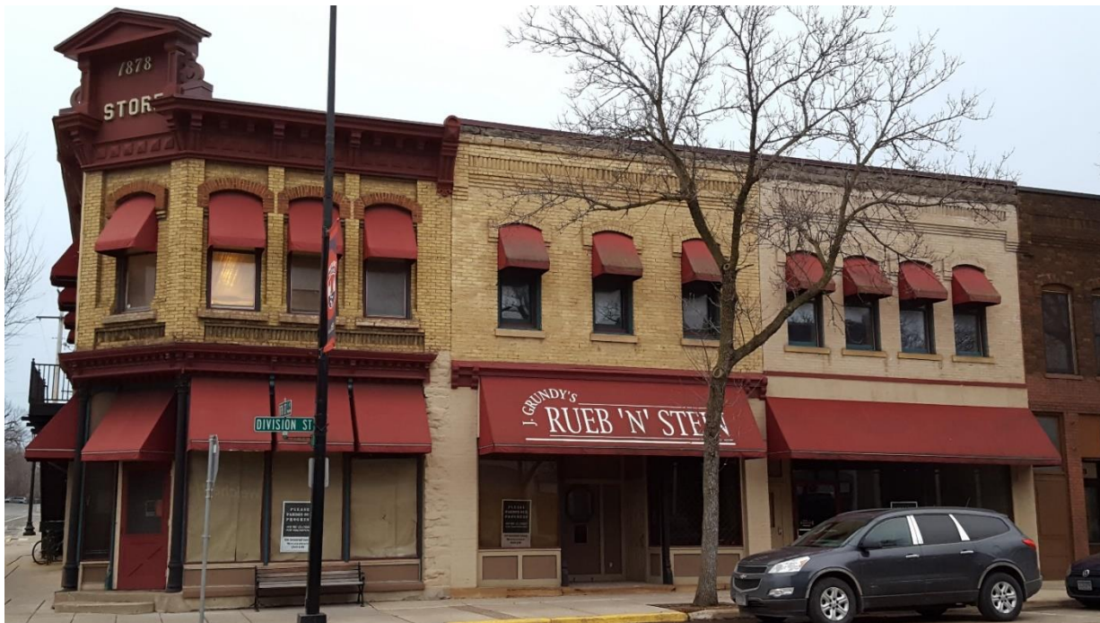
Current Storefront Colors – 2018