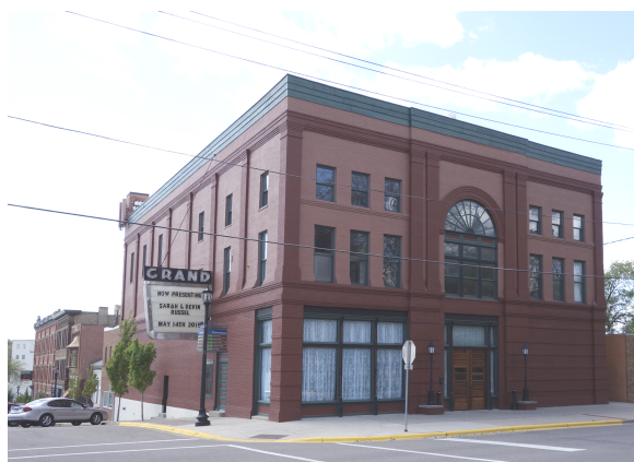
2016, looking west