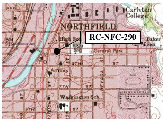
USGS: Northfield 1984