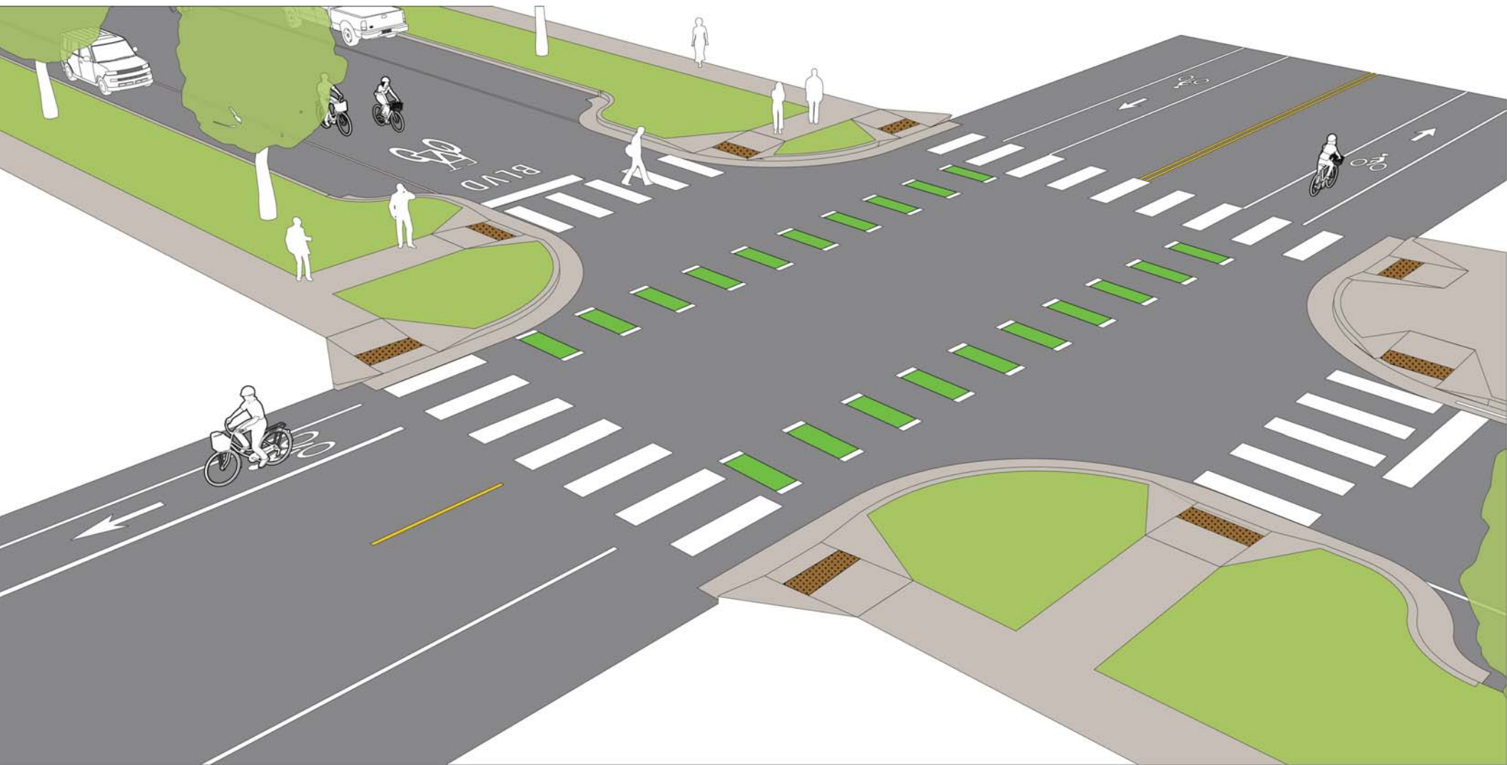
WASHINGTON STREET & 5th STREET PREFERRED CONCEPT