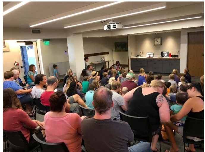
Eclipse storytime crowd photo

In August, two wildly popular eclipse-related programs were held, during each of which we handed out free eclipse glasses I’d obtained through a grant written late last March. Almost all of the 1000 pairs of glasses were distributed during the events (one for adults, one for families with younger children)—with a few left over to hand out to other visitors to the library.