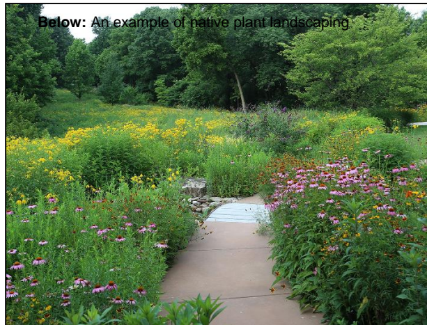
Below: An example of native plant landscaping

http://www.xerces.org/wp-content/uploads/2014/03/GreatLakesPlantList_web.pdf