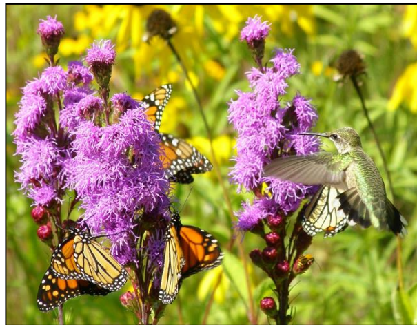
Top: Honeybee Bottom: Monarchs and Hummingbird