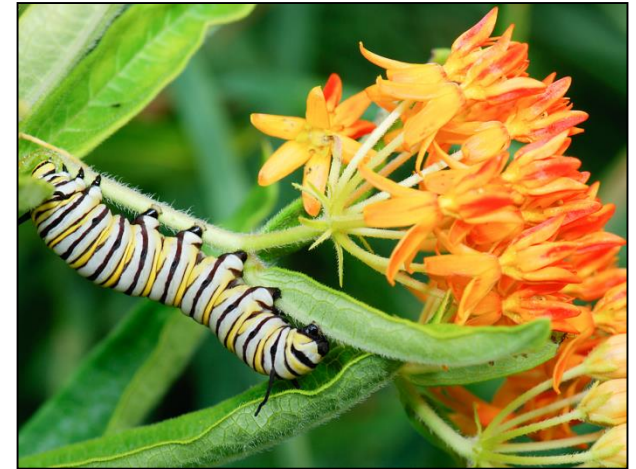
Above: Monarch caterpillar on butterfly milkweed

Talking with a specialist at a plant nursery or garden center can also help inform your decision.