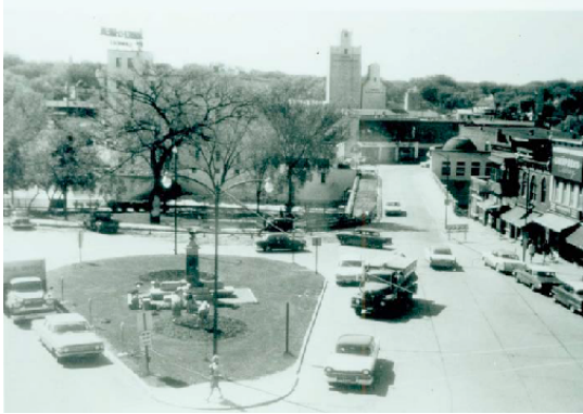
1950 (looking west from Division Street)