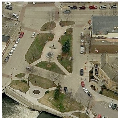
2016 (looking east from Cannon River)