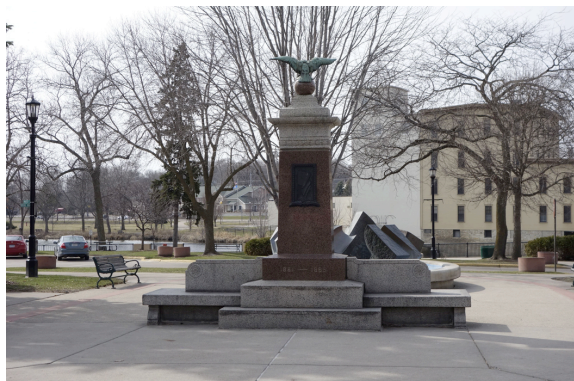
2016, looking west at Civil War Monument (1921)