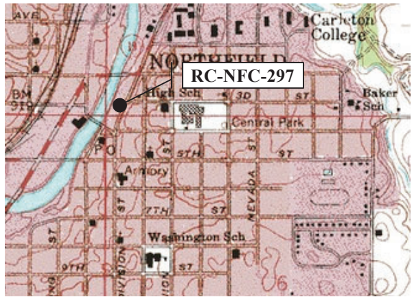
Sanborn Map and Publishing Co., 1930, updated to 1943.