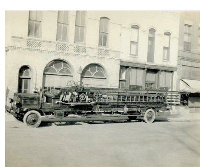
2016, looking west