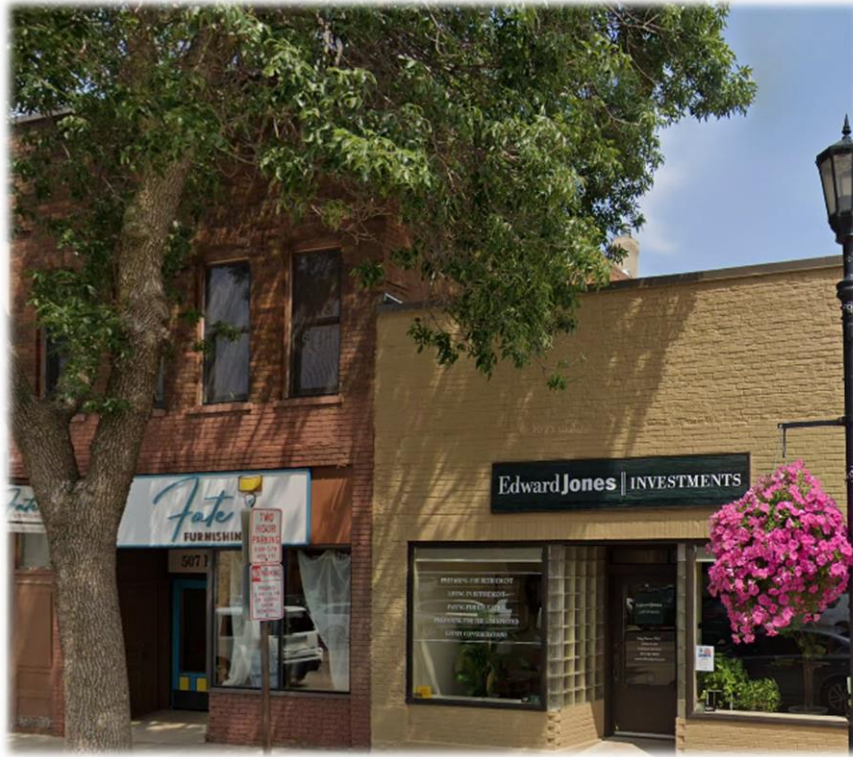
Figure 1 Nelson Building Downtown Northfield - Front Façade

The HPC reviewed and approved the application to rehabilitate Bridge Square. The HPC later amended the COA to add conditions related to the proposed site furnishings, including the lighting, benches, bollards, and bike racks.