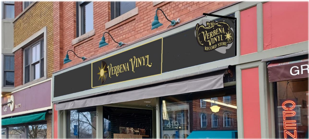
Figure 2 Verbena Vinyl, Downtown Northfield – Sign

Six (6) sign permits were reviewed and approved for the following properties: