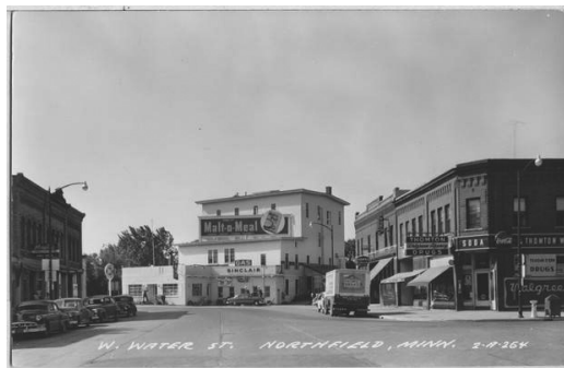
Ames Mill, looking south.