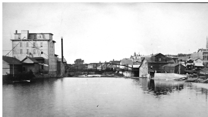
ca. 1900, looking north