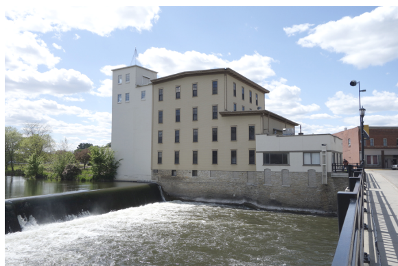
2016, looking northeast