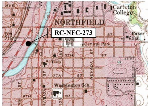
USGS Northfield 1984