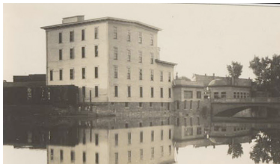
Ames Mill, ca. 1915, looking northwest.