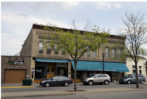
2016, looking east