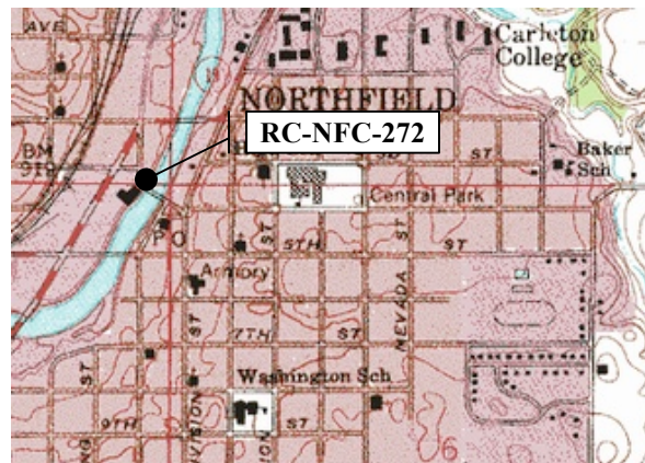
USGS Northfield 1984