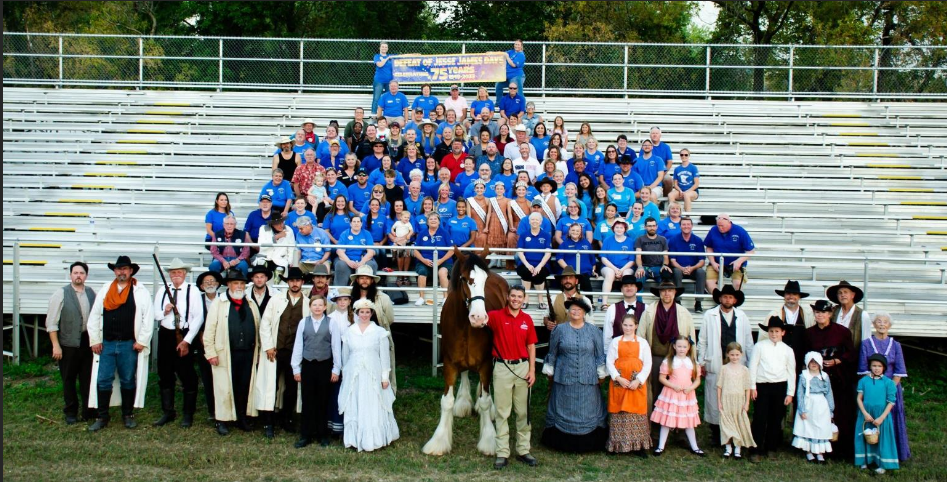
DJJD Family Photo 2023