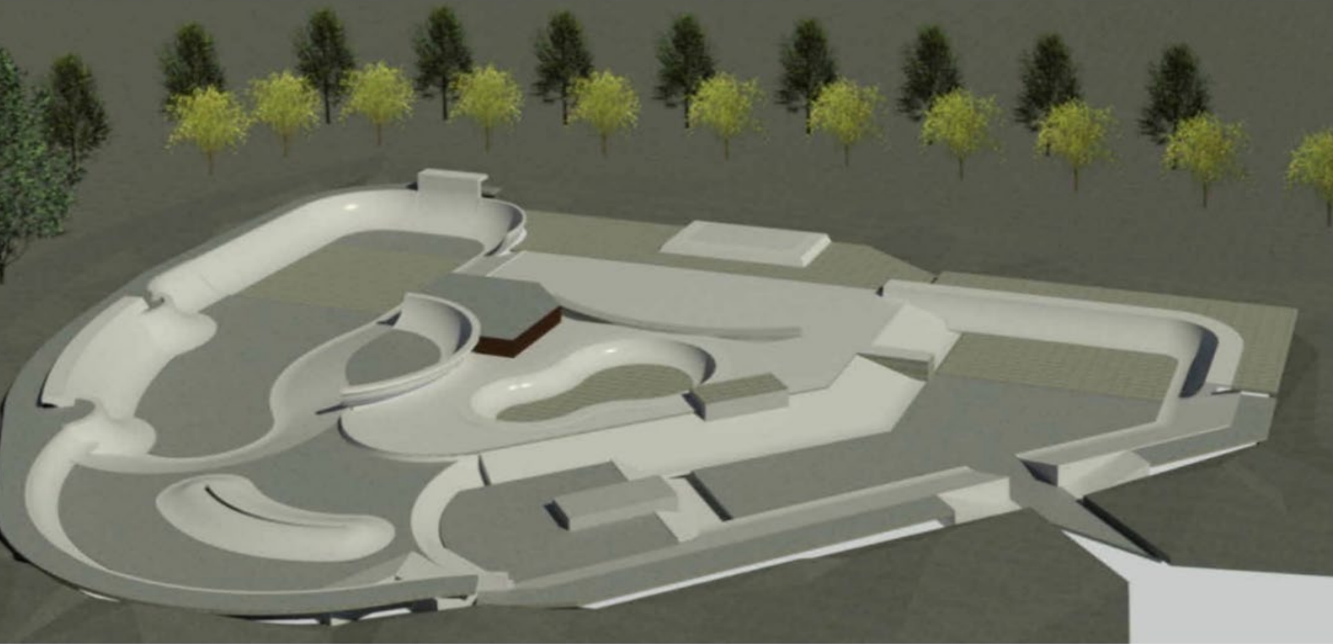
Initial Design Rendering – View Looking North