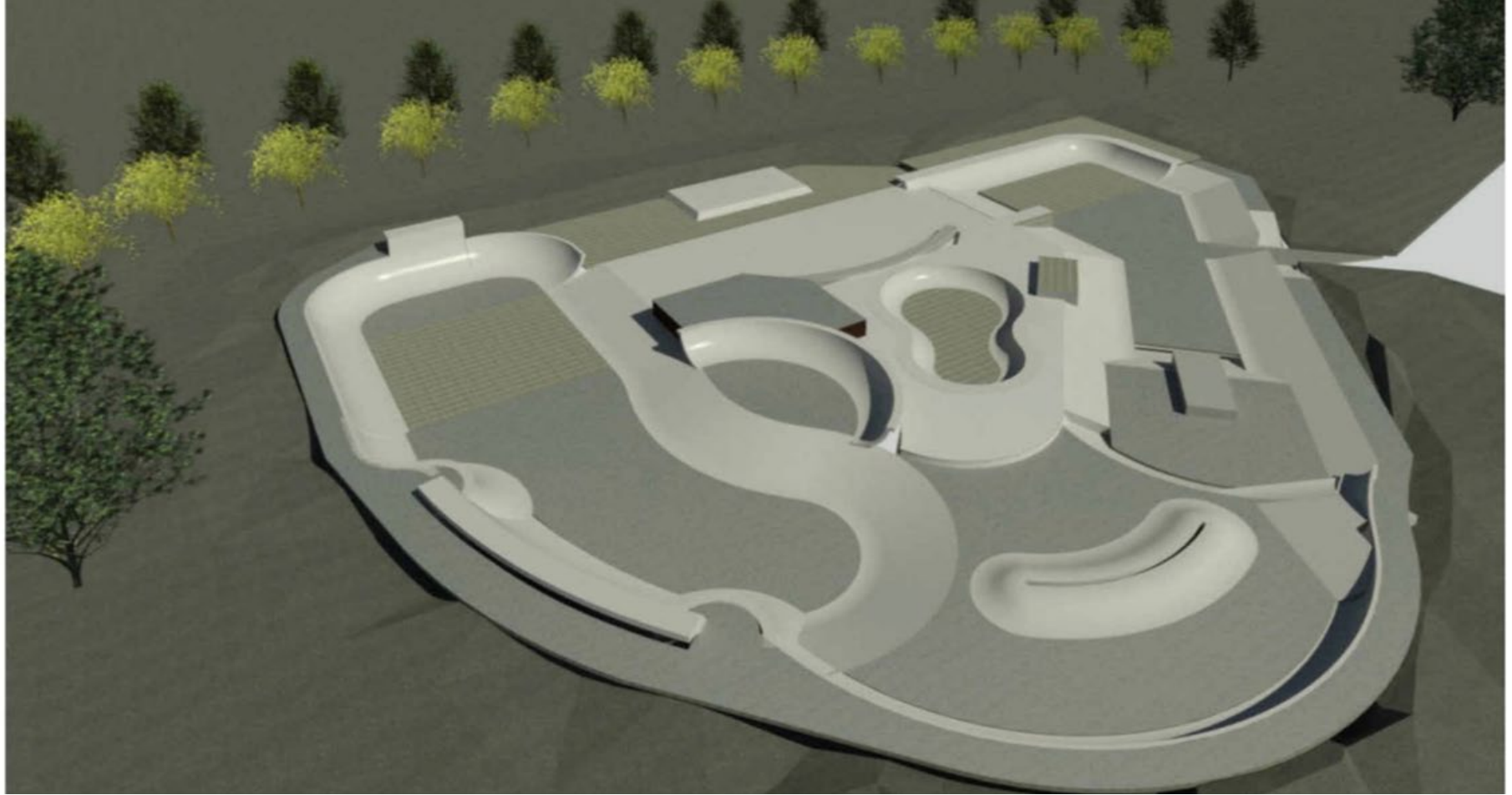
Initial Design Rendering 2 – View Looking Northeast