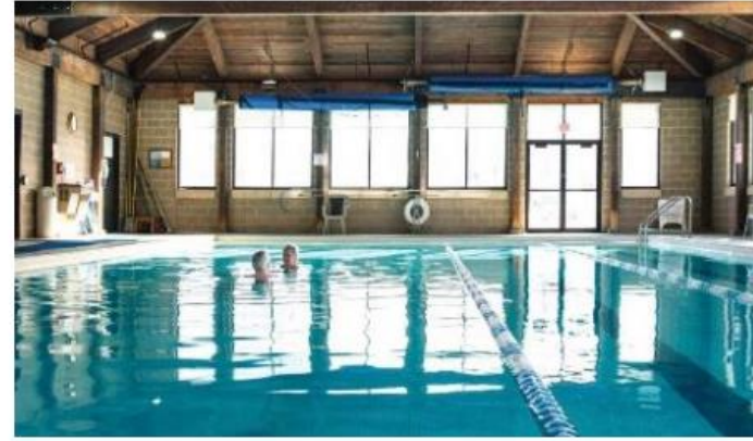
Warm Water Pool