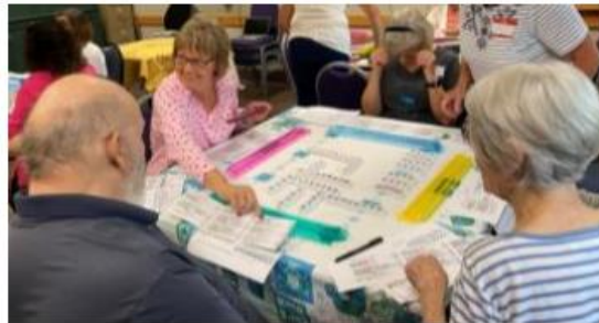
Cards & Games