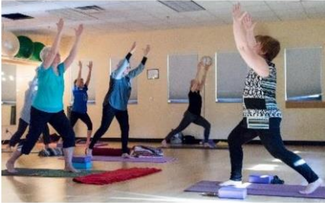
Group Exercise Studio