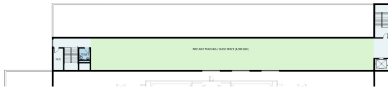
UPPER LEVEL FLOOR PLAN - DRYLAND TRAINING / LEASE SPACE ALTERNATE (5,300 GSF)