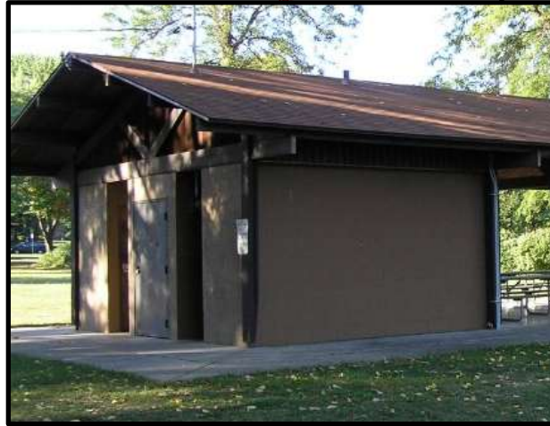
1 RS0 TOILET RM BLDG AND PICNIC STRUCTURE PLAN-EXISTING 1/4" = 1'-0"