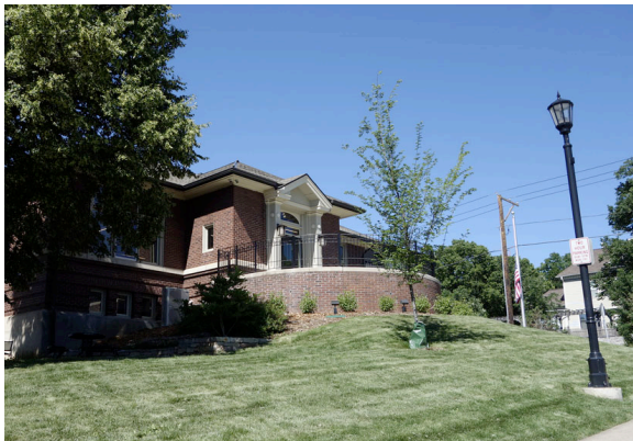
2016, looking north west at E. 3rd Street entry