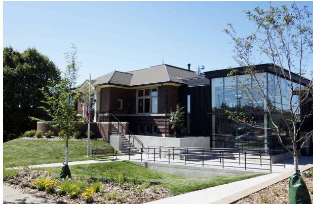
2016, looking northwest at new addition