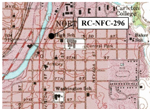
USGS: Northfield 1984