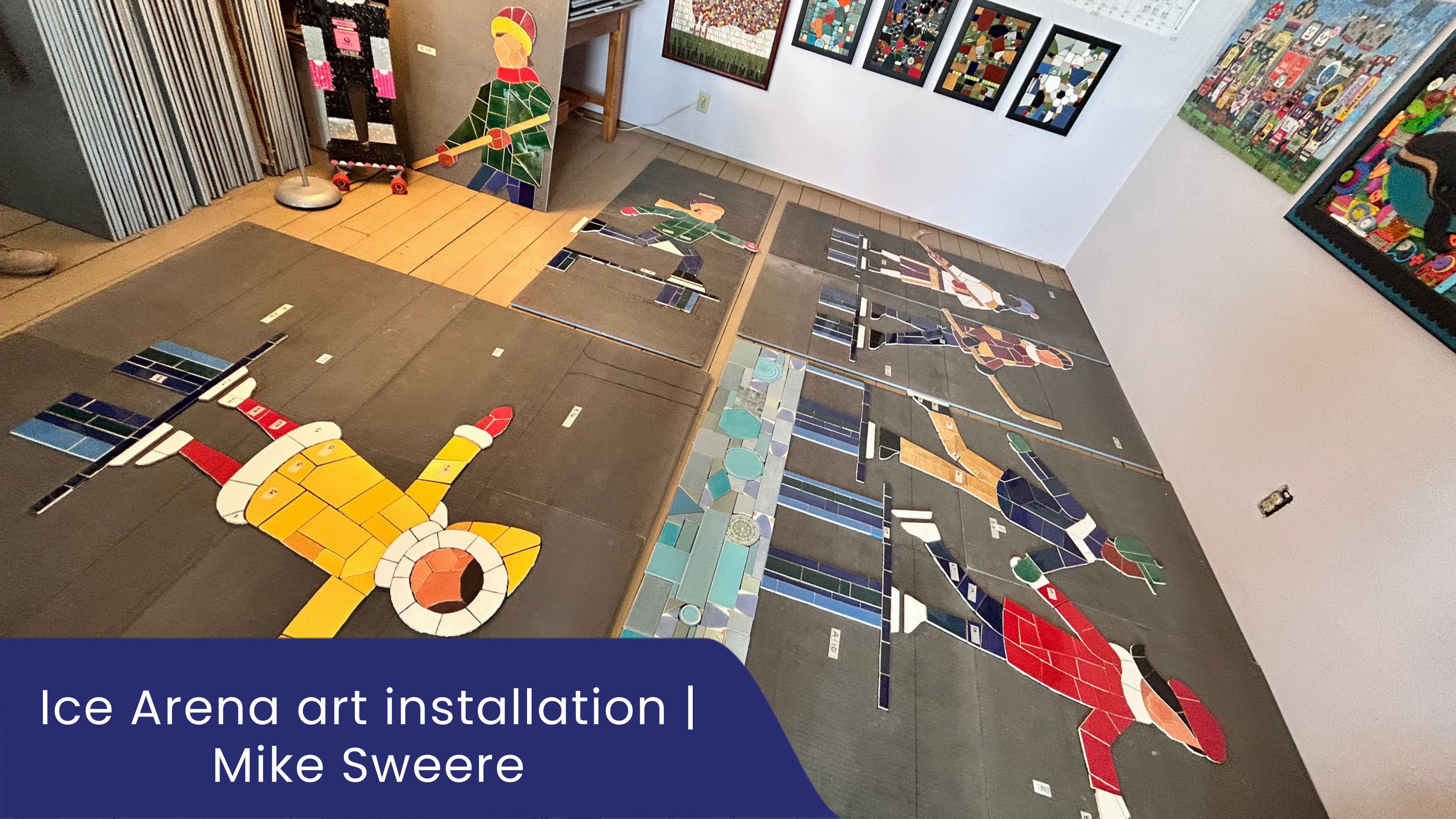
Ice Arena art installation | Mike Sweere