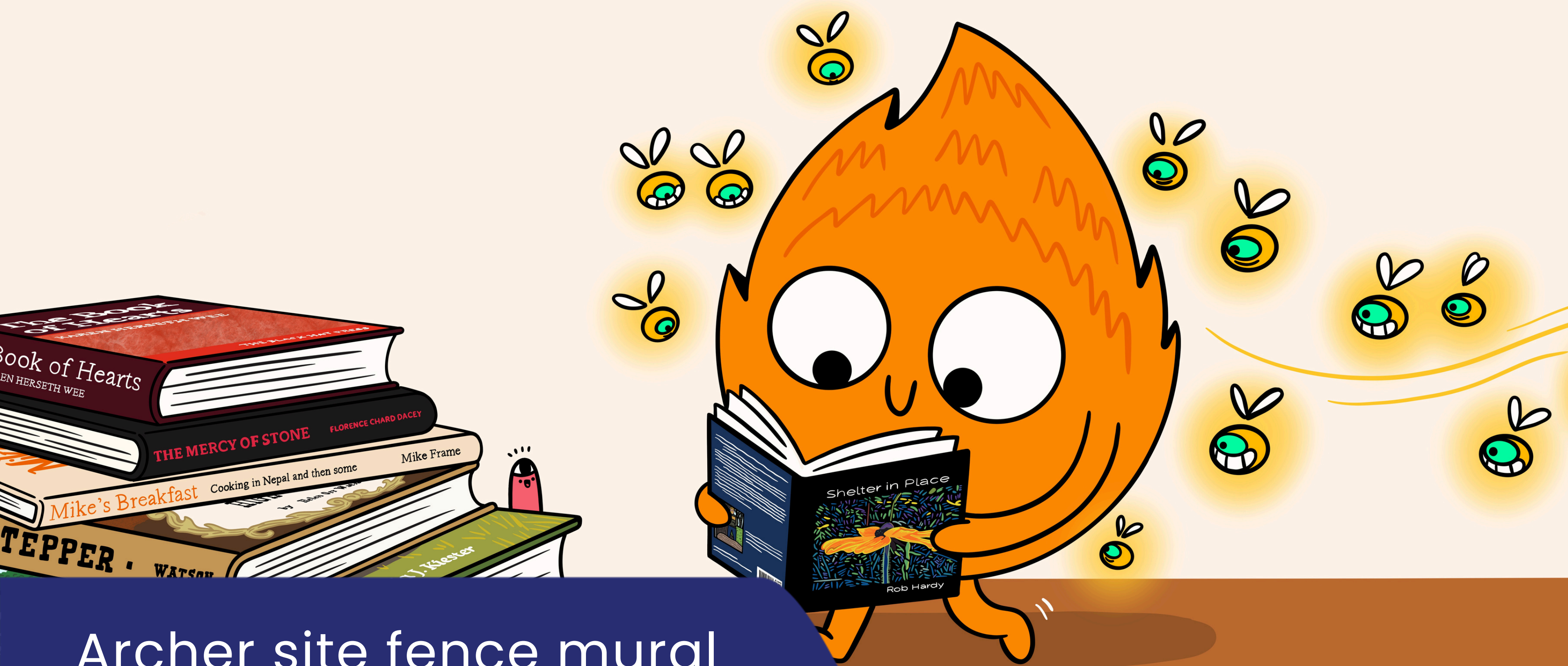
Archer site fence mural | Rocky Casillas Aguirre