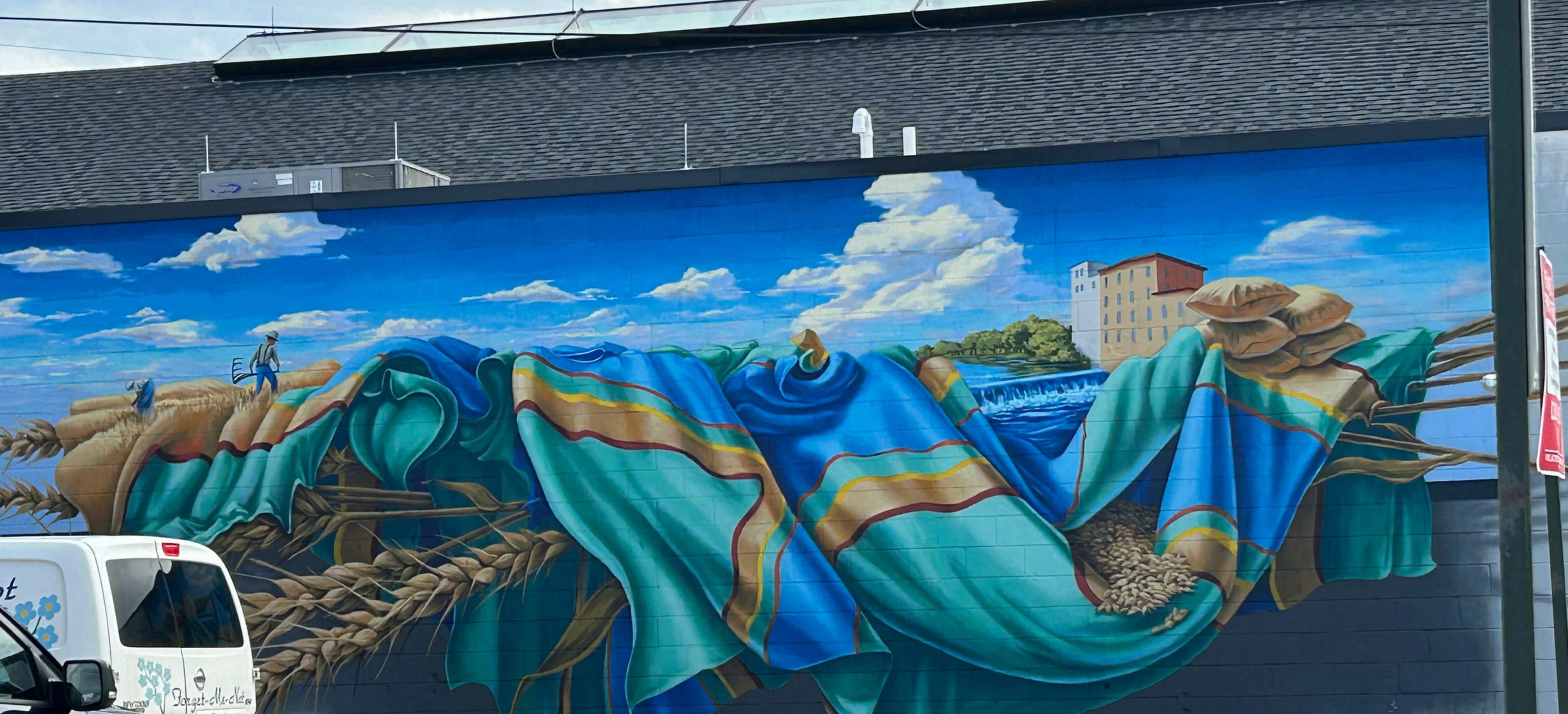
Loon Building mural | Dan Toro