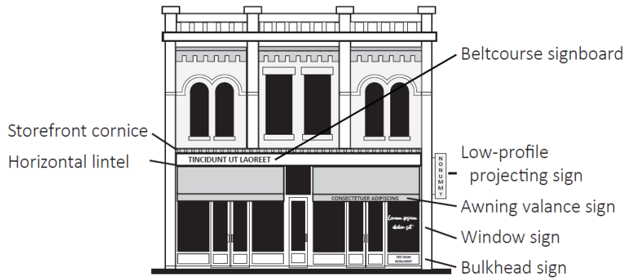
Figure 6-3: Illustration of where signs are historically attached to buildings in the downtown historic district.