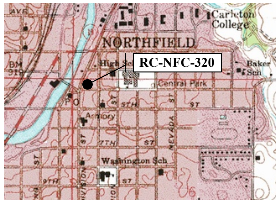
USGS: Northfield 1984.