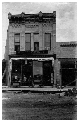
H. L. Greaves & Co., 325 Division Street, ca. 1883