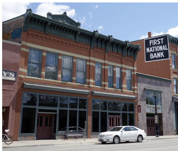
2016, looking southeast