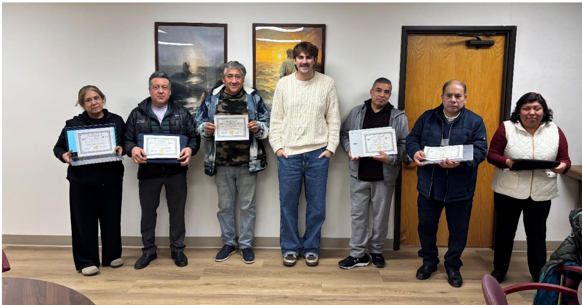
Technology class in Spanish winter class 2026- St. Dominic Church