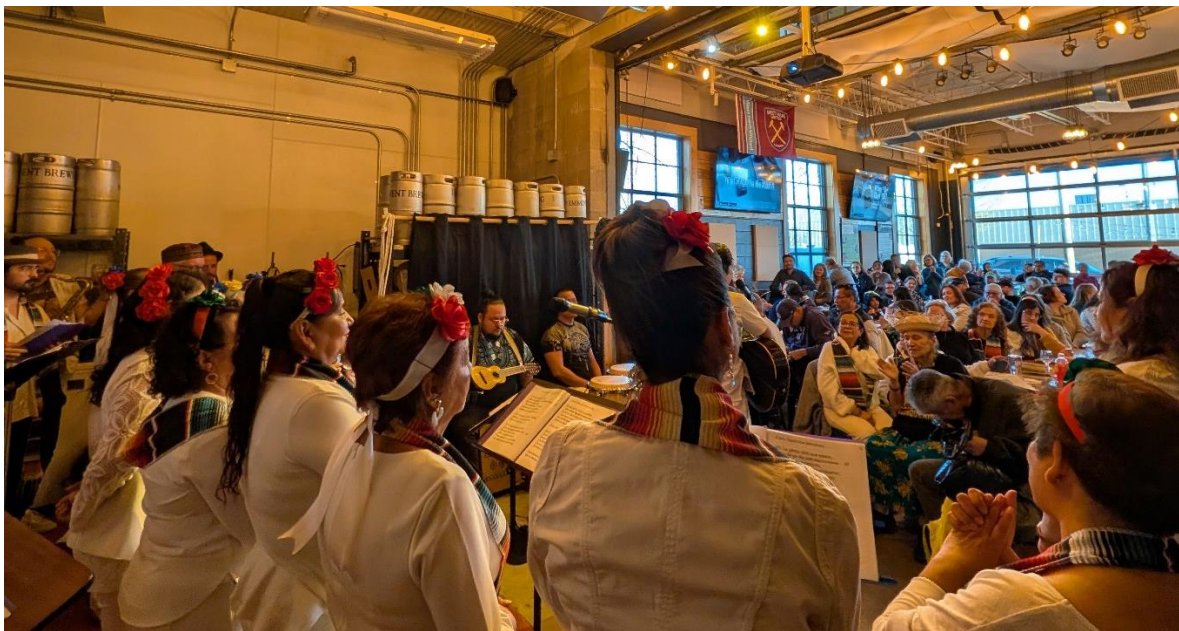
Sabios Cantores Northfield