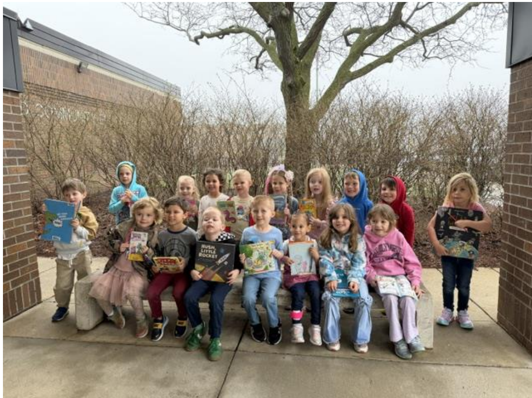
Hand and Hand – Preachool