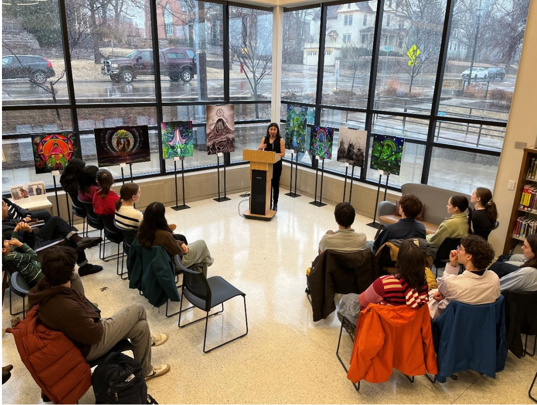
Photo Exhibit and presentation-Bêngbe Uaman Luare: Our Sacred Place