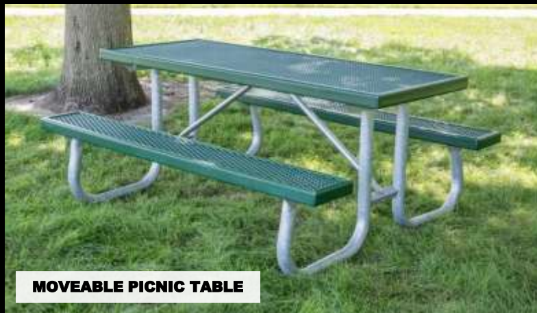
MOVEABLE PICNIC TABLE