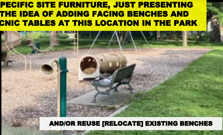
AND/OR REUSE [RELOCATE] EXISTING BENCHES

PLEASE NOTE: WE'RE NOT RECOMMENDING SPECIFIC SITE FURNITURE, JUST PRESENTING THE IDEA OF ADDING FACING BENCHES AND PICNIC TABLES AT THIS LOCATION IN THE PARK