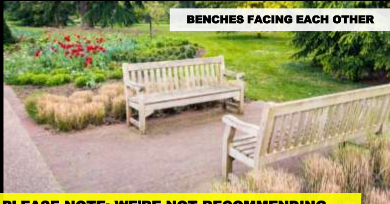
BENCHES FACING EACH OTHER

PLEASE NOTE: WE'RE NOT RECOMMENDING SPECIFIC SITE FURNITURE, JUST PRESENTING THE IDEA OF ADDING FACING BENCHES AND PICNIC TABLES AT THIS LOCATION IN THE PARK