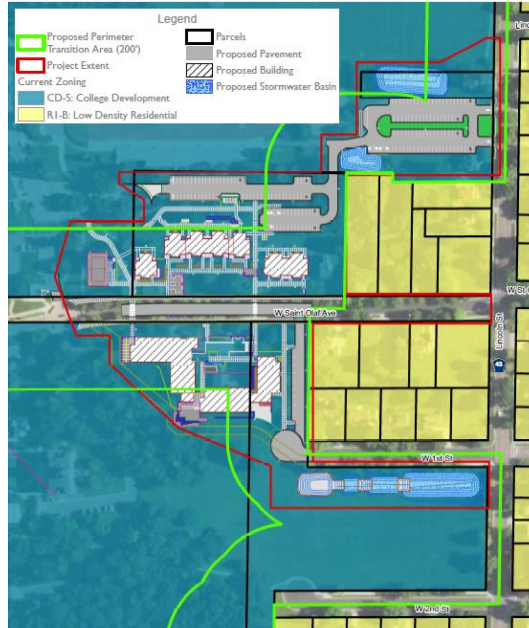
Map of the Site Plan overlaid by the Perimeter Transition Area