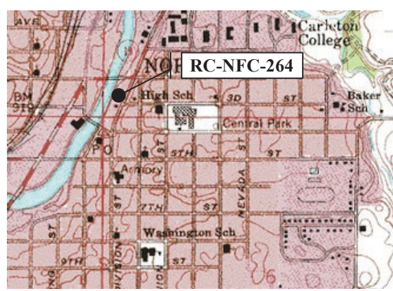
USGS: Northfield 1984.

Historic photographs: Northfield Historical Society