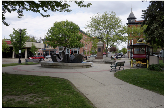
2016, looking east at Fountain (1980)