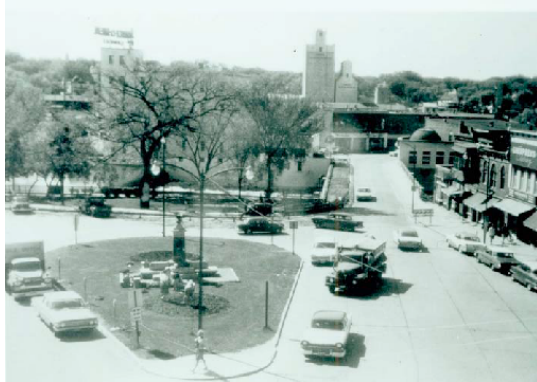
1950 (looking west from Division Street)