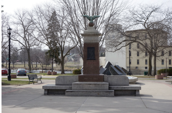
2016, looking west at Civil War Monument (1921)