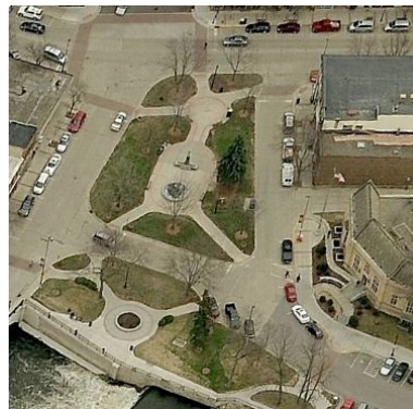
2016 (looking east from Cannon River)