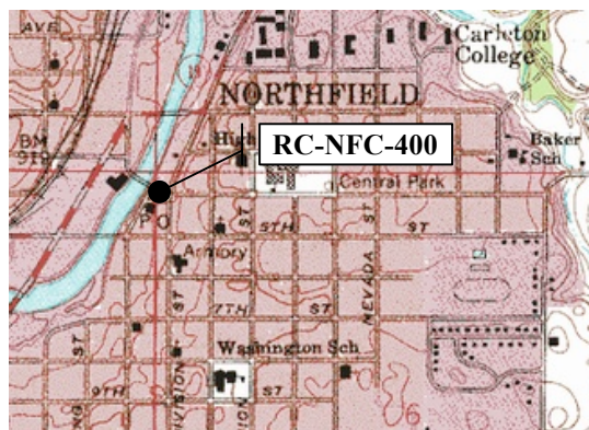
Left: Sanborn 1930, updated to 1943. Right: Northfield USGS 1984.