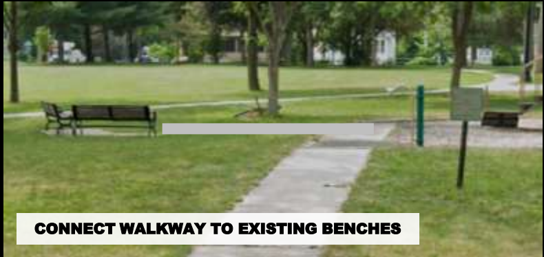
CONNECT WALKWAY TO EXISTING BENCHES