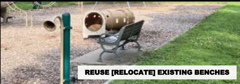
REUSE [RELOCATE] EXISTING BENCHES