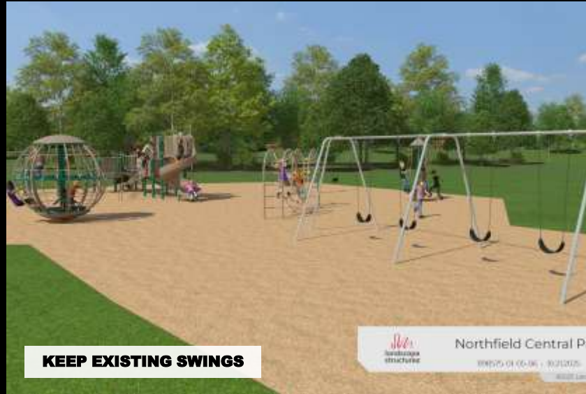
KEEP EXISTING SWINGS