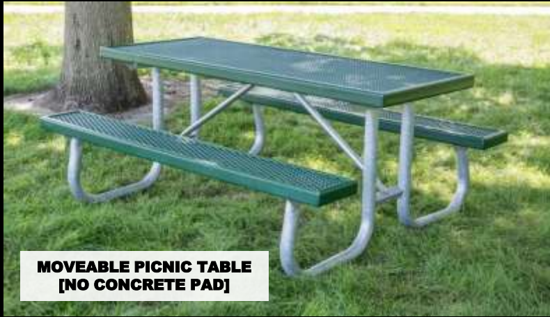
MOVEABLE PICNIC TABLE [NO CONCRETE PAD]