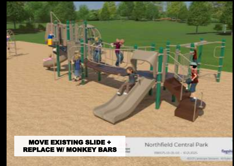
MOVE EXISTING SLIDE + REPLACE W/ MONKEY BARS