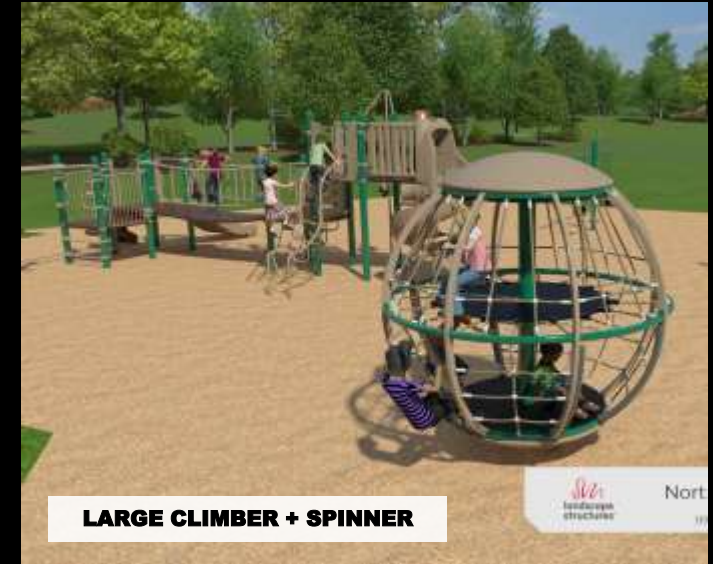
LARGE CLIMBER + SPINNER