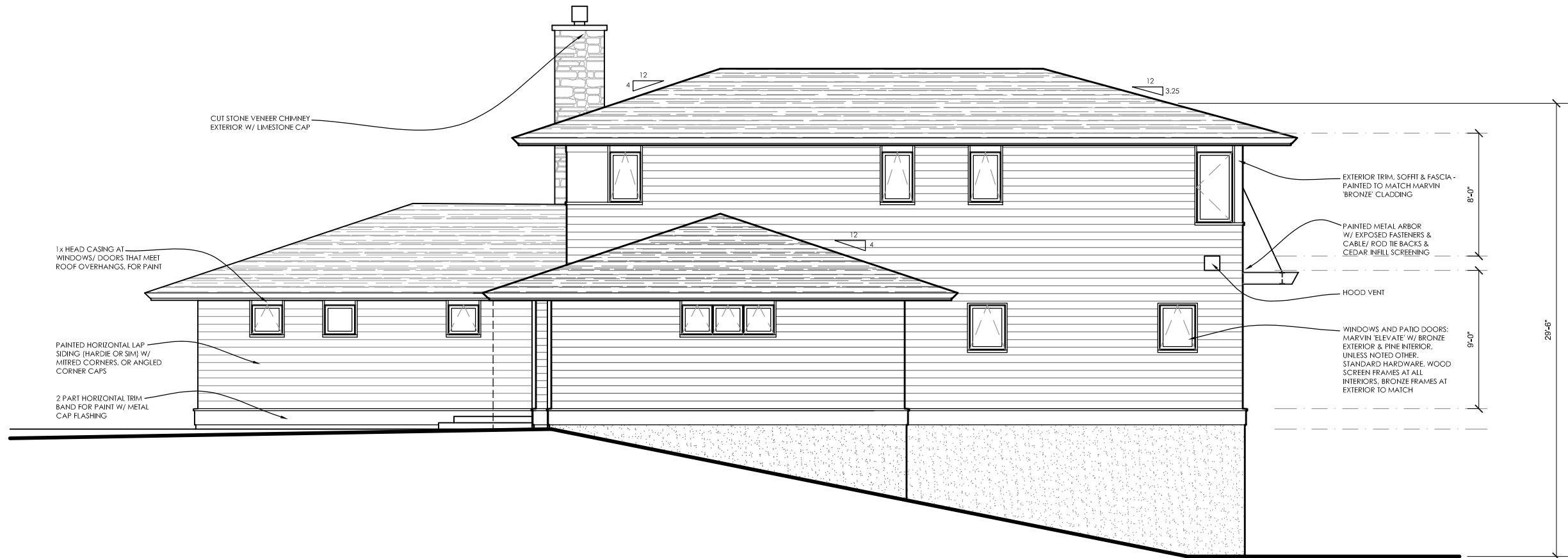
2 PROPOSED NORTH ELEVATION SCALE: 1/4" = 1'-0"