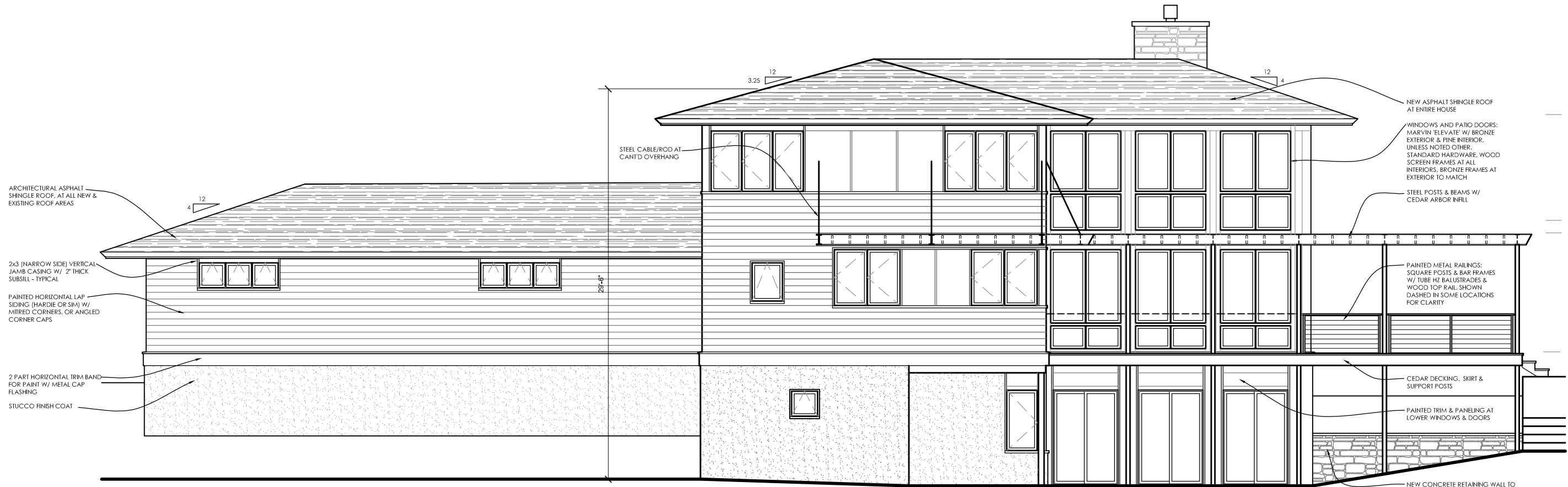
1 PROPOSED WEST ELEVATION SCALE: 1/4" = 1'-0"

VARIANCE APPLICATION - NOT FOR CONSTRUCTION