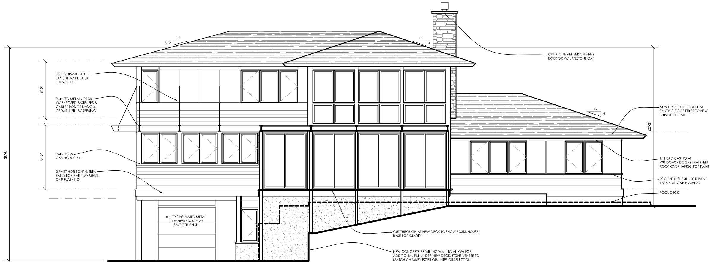
2 PROPOSED SOUTH ELEVATION SCALE: 1/4" = 1'-0"