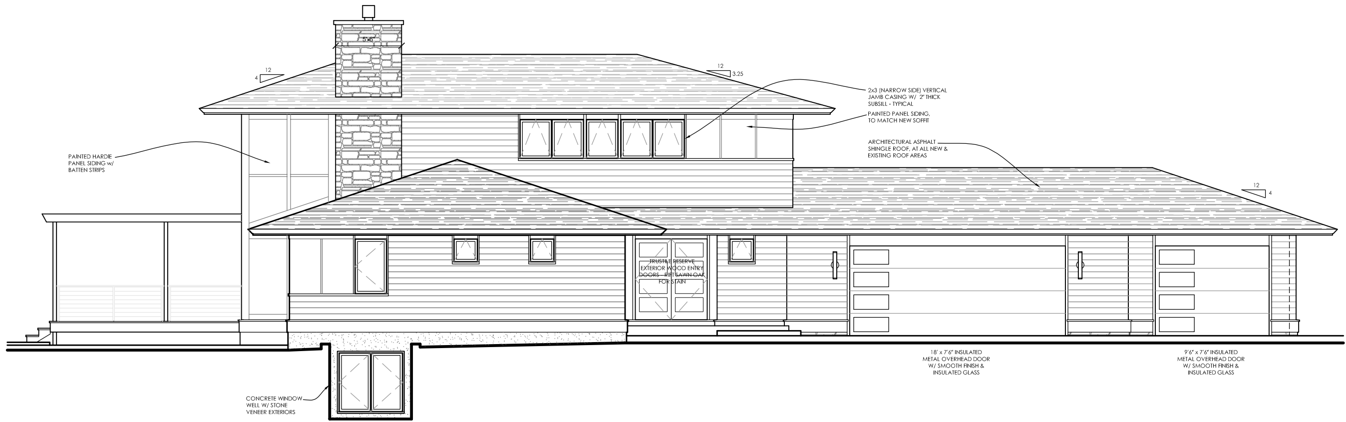
1 PROPOSED EAST ELEVATION SCALE: 1/4" = 1'-0"