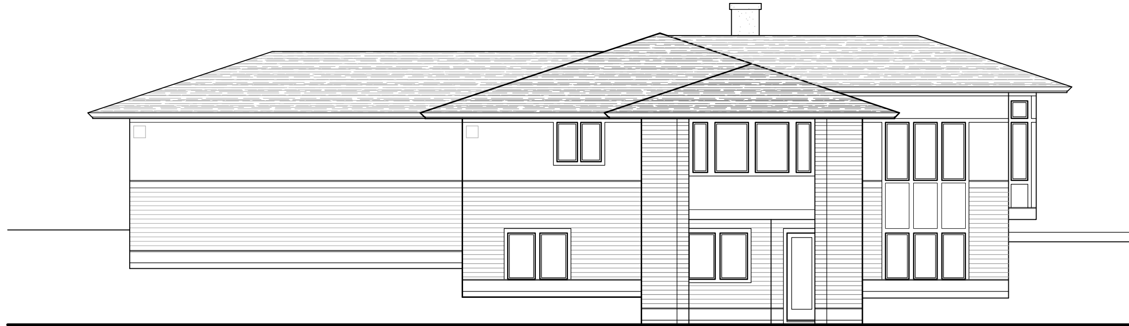
1 EXISTING SOUTHWEST ELEVATION SCALE: 1/4" = 1'-0"