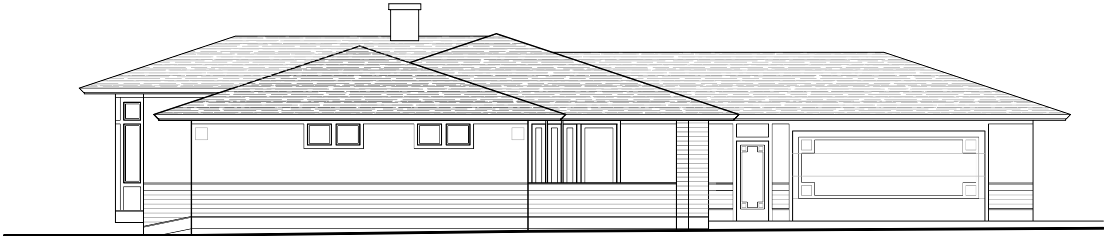
1 EXISTING NORTHEAST ELEVATION SCALE: 1/4" = 1'-0"